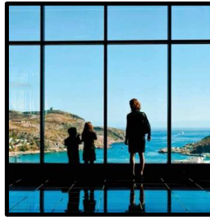
View from the Rooms !

The provincial museum and archives, The Rooms, will set the stage for our closing gala. Inspired by the fishing stages and stores of our past, it is a beautiful, modern facility with panoramic views of St. John's Harbour, the Narrows and Signal Hill. You will be treated to still more of our diverse cultural and culinary offerings. You won't want to miss this spectacular evening.