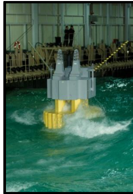
NRC OCRE Wave Tank

a world-class centrifuge facility, a full mission ship's bridge simulator, or the Autonomous Ocean Systems Laboratory, we're certain the technology will be dwarfed only by the colourful characters and story-tellers you'll meet on your visit.