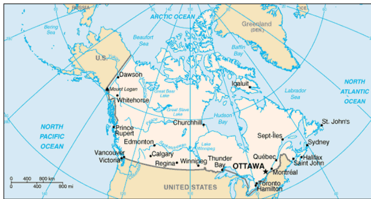
The Atlantic, Pacific and Arctic Oceans !

The province of Newfoundland and Labrador holds up the most eastern part of our country, and is also home to Cape Spear, the most easterly point in North America. Part of our province is literally a rock in the sea.