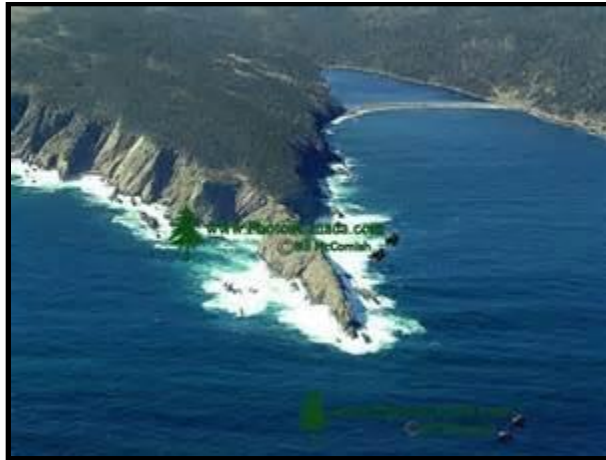
The Newfoundland Coastline

So you can see why we have a vested interest in our oceans and a great deal of expertise in ocean and marine technology.