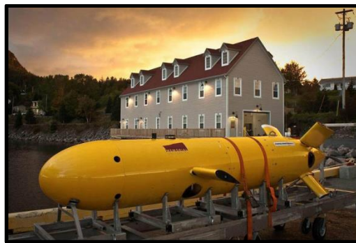
Marine Institute Holyrood

http://www.oceans14mtsieestjohns.org/userfiles/files/documents/holyrood.pdf